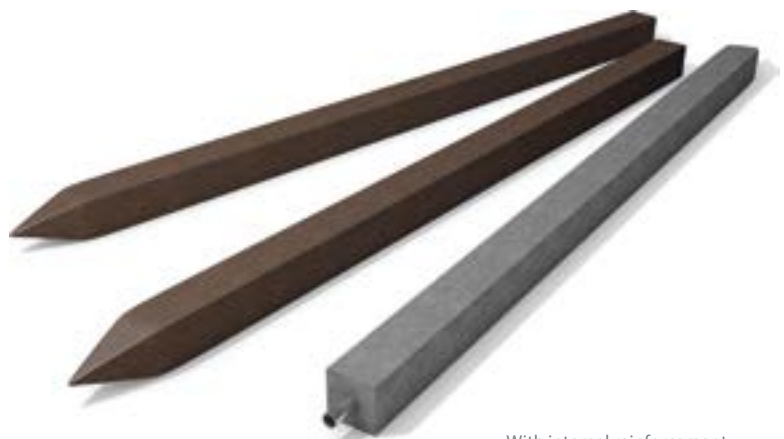
..... With internal reinforcement (Sectional view)