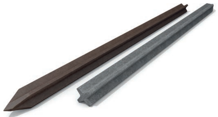
■ Grey ■ Brown